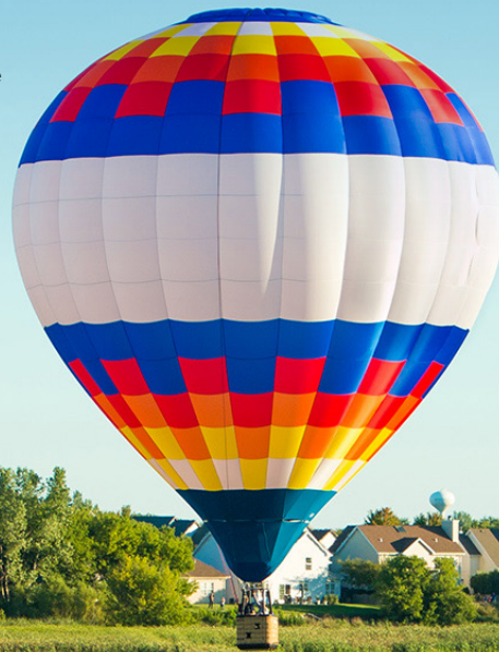
"Near Touch Down" by Patty Hultquist, 2017 Photo Contest Winner. Submit your photo to the 2018 contest at lith.org/photocontest .

Learn about the implementation of the Village's new Strategic Plan on page 3. View the entire plan online at lithplan.org .