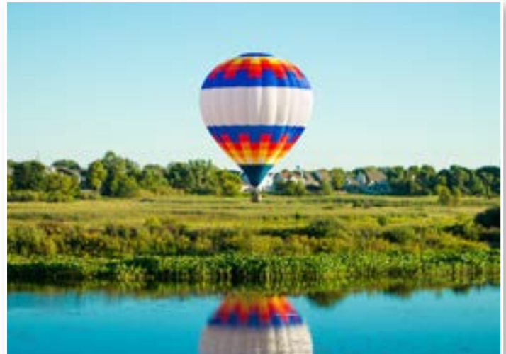
"Near Touch Down" - 2017 Winning Photo by Patty Hultquist