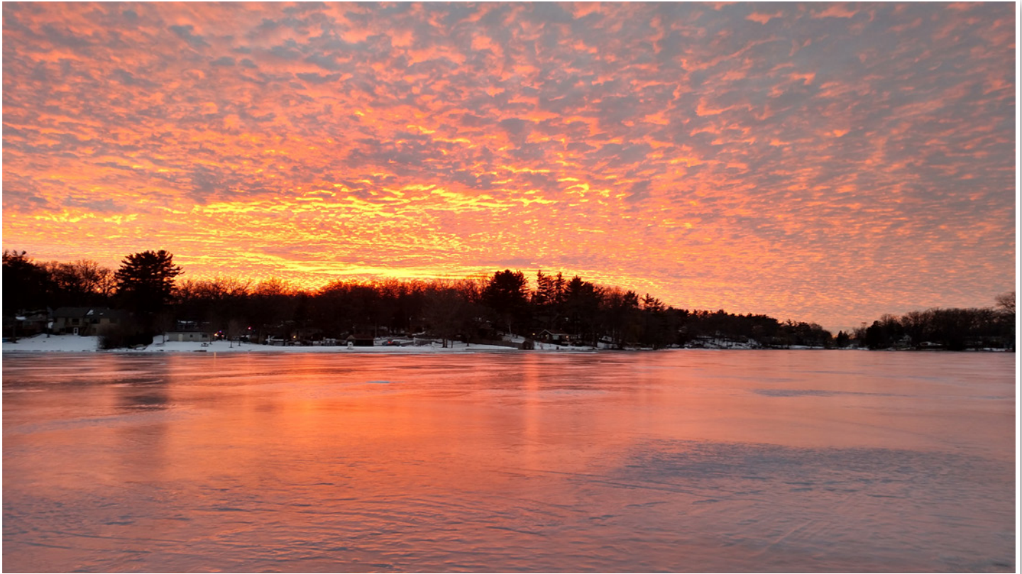
“Fire and Ice” - 2016 Winning Photo by Ross Nelson