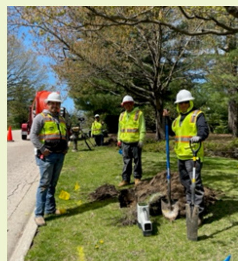
i3 Broadband crew members working on a job site.

For additional questions, please contact Public Works at 847-960-7500. Stay tuned to the Village's website for updates on this project as it progresses.