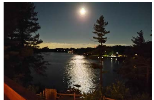
2022 First Place Winner - "It's a Marvelous Night for a Moondance" by Candice Tazbier

We have been accepting submissions for the 2023 Photo Contest throughout the summer. The deadline to enter is September 5, so stay tuned on our website at lith.org/photocontest and on our social media channels to participate in the voting process! Help us determine which photo best captures life in Lake in the Hills.